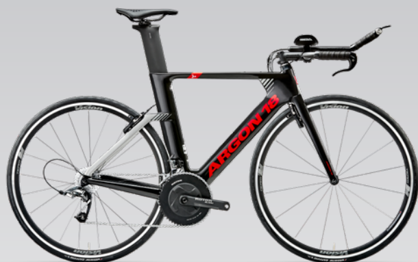
344A - SILVER RABBIT BLACK

The perfect bike for those looking to take their IM training up a notch — without breaking the bank.