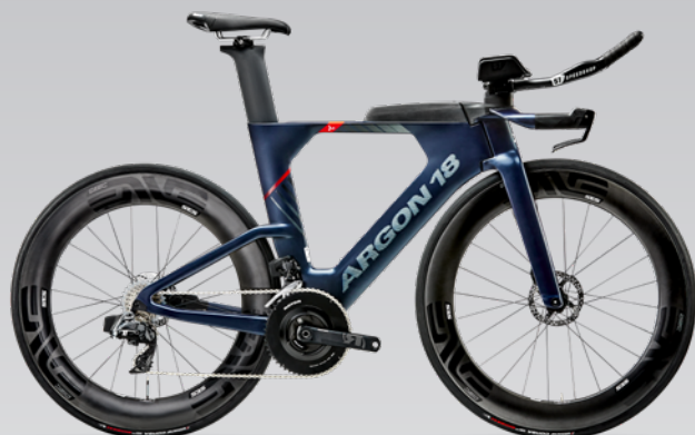
345A - KAILUA FULL MOON

You're out to win. Everything aligns with that goal: your position, nutrition, components, power transfer, and your hunt for innovation. The E-119 Tri+ Disc is your race day weapon.