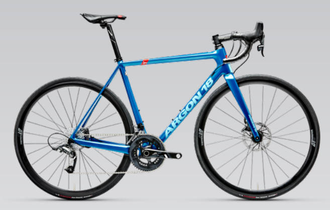
322A - VIBRANT BLUE METALLIC

Designed on the same platform as the Gallium Pro Disc and the Gallium Disc, the Gallium CS guarantees years of enjoyment to newcomers to the sport and to more seasoned cyclists on a tighter budget.