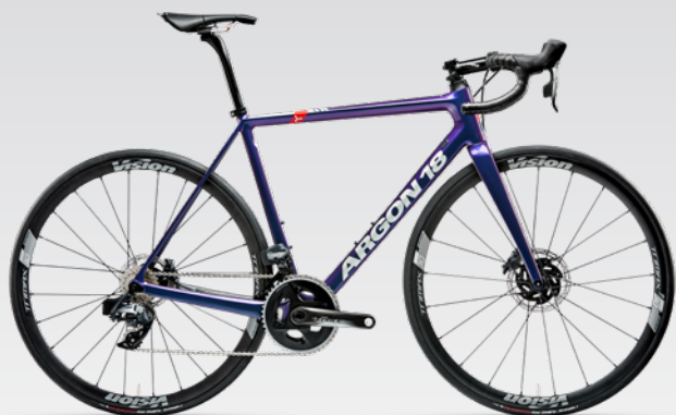
339B - RADIANT BLUE RAIN