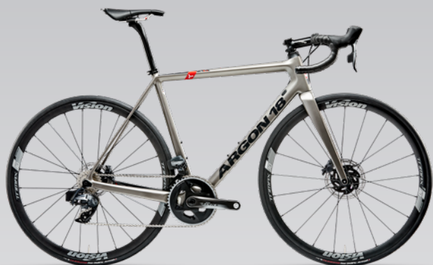
339A - SILVER TITAN

Ideal for those ready to make their mark at the Tuesday night crit, or set tempo on the front of the group ride.