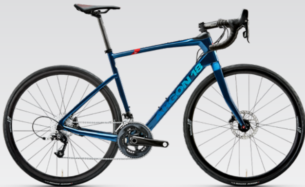
335B - PEARL DARK BLUE