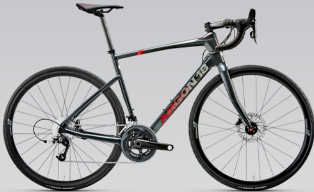
335A - SILVER COSMOS GREY

Ideal for the endless explorer who doesn't stop because the roads get less familiar.