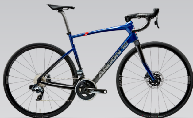
334A - STELLAR IMPERIAL BLUE TO BLACK GRADIENT

Whether it's Gran Fondos or weekend epics, this bike is ready for all weather, all roads and all challenges. Meant for cyclists who want to ride, ride, ride, and ride.