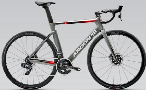
340A - FROZEN STEEL WITH GLOSS STRIPES

Ready for the rider who lives for the epic solo breakaway, or group sprint to the city limits sign, and the triathlete looking for a versatile training and racing solution.