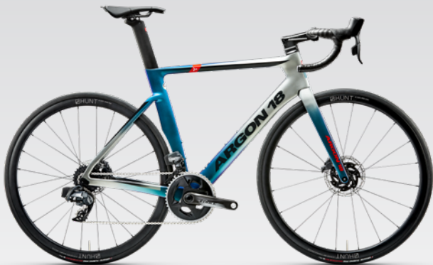
340B - SILVER TO RADIANT DIG ME BEACH GRADIENT