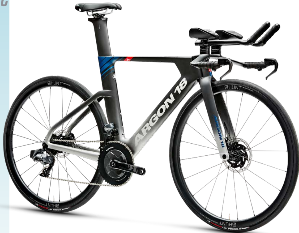
315A - Black Frozen to Grey, Matte

At 250g lighter than the previous-generation E-118Next and equipped with discs, the E-118 Tri+ combines the razor-sharp handling and aerodynamic performance of a TT champion with tri-specific fit and functionality. Using Notio for our racecourse and velodrome testing has shown a gain of 8 to 10 watts at 50km/h over the E-118Next. The E-118 Tri+ Disc is our premium UCI-legal bike with the lean, low race frame of a TT champion – but tailored for triathletes.