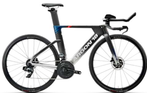
315A - Black Frozen to Grey, Matte

FIT AND POSITIONING · With new geometry to achieve a significantly lower front profile, our updated Oneness system offers a bar/stem system with armrest stack 2cm lower and grip position 4cm lower than the E-118Next. This allows athletes to achieve a low, aggressive position, and for smaller riders to find their perfect fit.