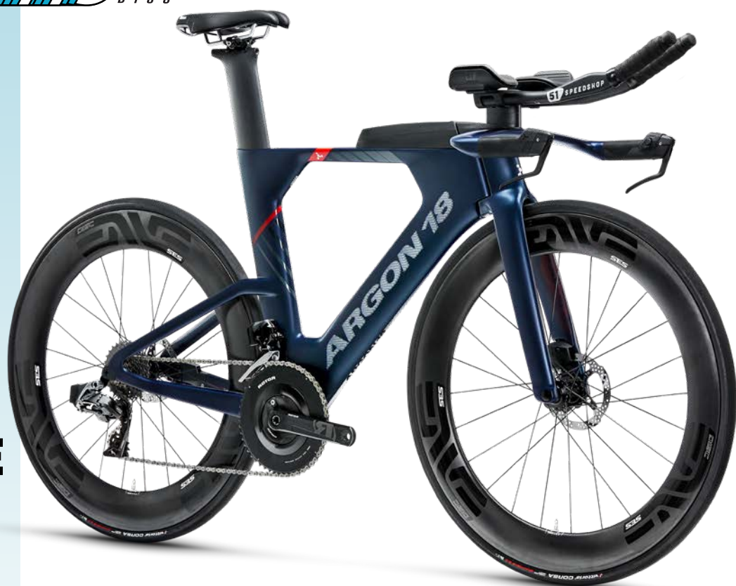
345A - Kailua Full Moon, Matte/Gloss

EVERY SECOND. EVERY WATT. EVERY ADVANTAGE