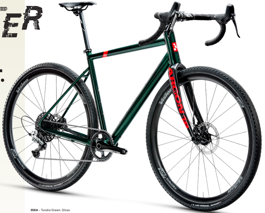
356A - Tundra Green, Gloss

Really – go get lost. You’ve got extra snacks, gear, and you’ve got the bike that will go anywhere with you. Kicking up rocks on an old logging road? No problem. Muddy singletrack? Comes off easy. Grit pinging your frame for the next hundred miles? Didn’t notice. No more excuses – get rough and ready for anything on the new Grey Matter. Based on the Dark Matter, the Grey Matter is the ultimate dirt machine thanks to its gravel-specific geometry, handling and its many features.