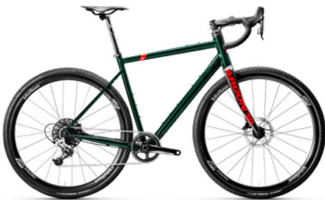
356A - Tundra Green, Gloss

LOADED WITH FEATURES · Internal cable routing at the headset external at chainstays, a 27.2mm Ø seatpost and our 3D headset with cable integration for easily dialled-in fit options.