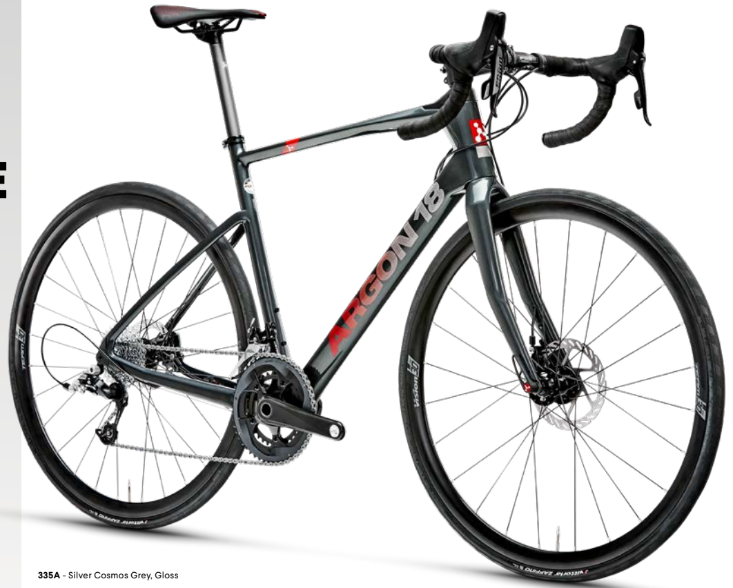
335A - Silver Cosmos Grey, Gloss

An extremely versatile bike that's ready for anything, from your next commute to fast commutes. Confident handling, road-vibration dampening, and an endless appetite for all-day adventure make this an all-road machine tuned to make any surface feel firm – and fast. The Krypton CS ensures maximum pedaling efficiency for high performance. No matter how rough the road you travel, this tough-as-nails bike is designed with geometry for those who are in it for the long haul.