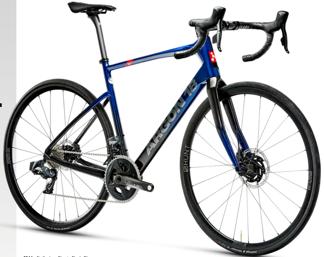
334A - Stellar Imp. Blue to Black, Gloss