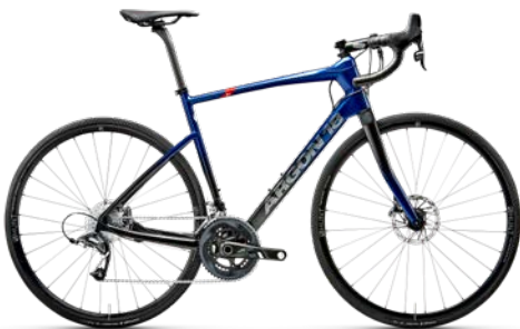
334A - Stellar Imp. Blue to Black, Gloss

* Only available with electronic configurations (eTap, Di2, WE)