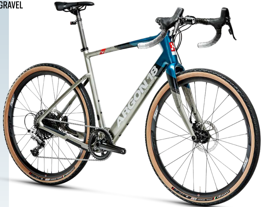
314B - Blue/Grey ,Gloss

For those who live to go out of bounds, get ready to set new limits with the Subito eGravel. Get that first kick through the washboard up a climb, or extra jump through muddy ruts. Built on the ebikemotion platform, the Subito eGravel promises a little something extra when that kick is needed. Stable ride quality from a longer wheelbase, dropped chainstays and clearance for 650x47C tires offer the confidence to take the road less travelled. Just like our endurance models, the handling components have been tuned to offer a precise and predictable riding experience, so that you can get up to a little trouble without losing your grip.