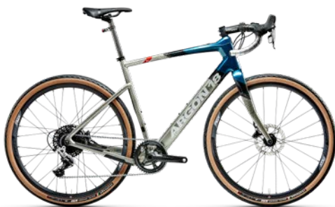
314B - Blue/Grey, Gloss

Photos are for illustrative purposes only. Product not necessarily sold as shown.