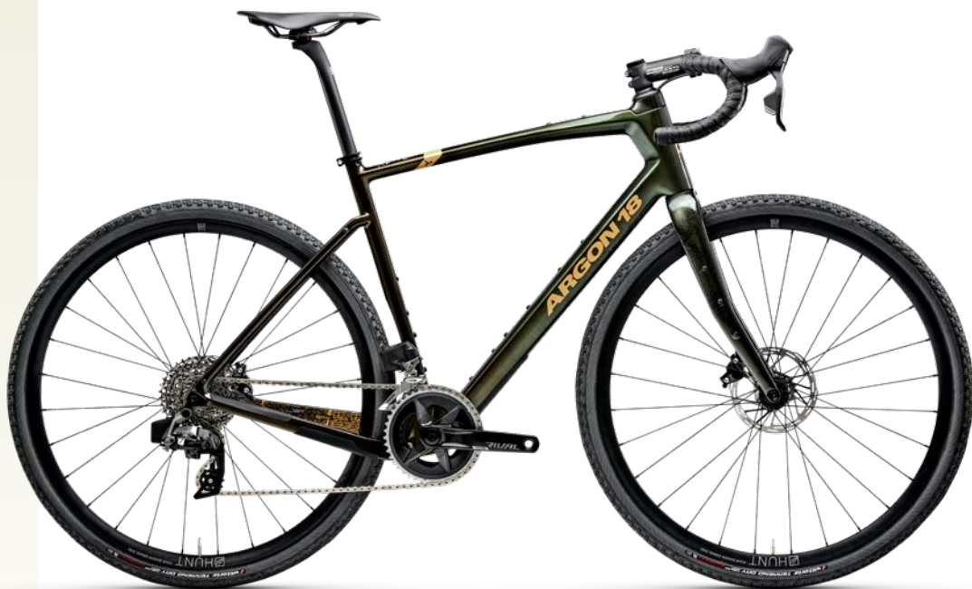
NEW 363A - Wild Olive, Gloss

AND RUGGED. AND DUSTY. PROBABLY UNPREDICTABLE. IF THAT SOUNDS JUST ABOUT RIGHT TO YOU, MEET THE 2023 DARK MATTER.