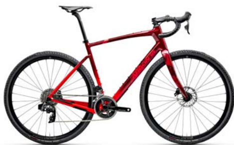
Also available NEW 363B - Inferno Red, Gloss

Photos are for illustrative purposes only. Product not necessarily sold as shown.