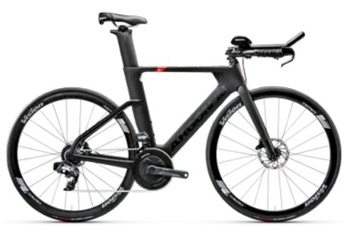
Also available 317B - Black, Matte

\begin{tabular}{ll} \textbf{SIMPLICITY AND CONVENIENCE} & \textbf{No proprietary integration makes the E-117 Tri Disc easy to ride,} \\ easy to travel with, and easy to maintain. Ready for all storage needs, including toptube, downtube and rear hydration mount. The addition of disc brakes makes wheel changes easier, as there are no brake adjustments to make and no brake pads to swap when switching to race-day carbon wheels. \\ \end{tabular}