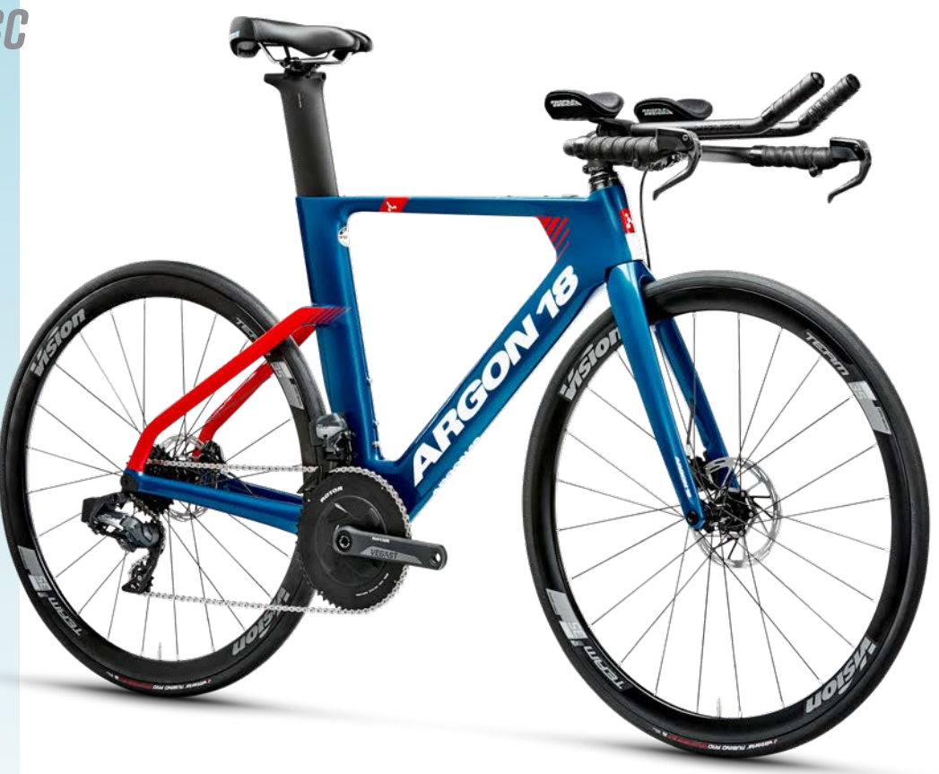
317A - Ocean Blue, Gloss

Already known for its superb handling, the addition of disc brakes to the E-117 Tri provides increased confidence, additional clearance for overall comfort (28c), and the added stiffness of thru-axles.