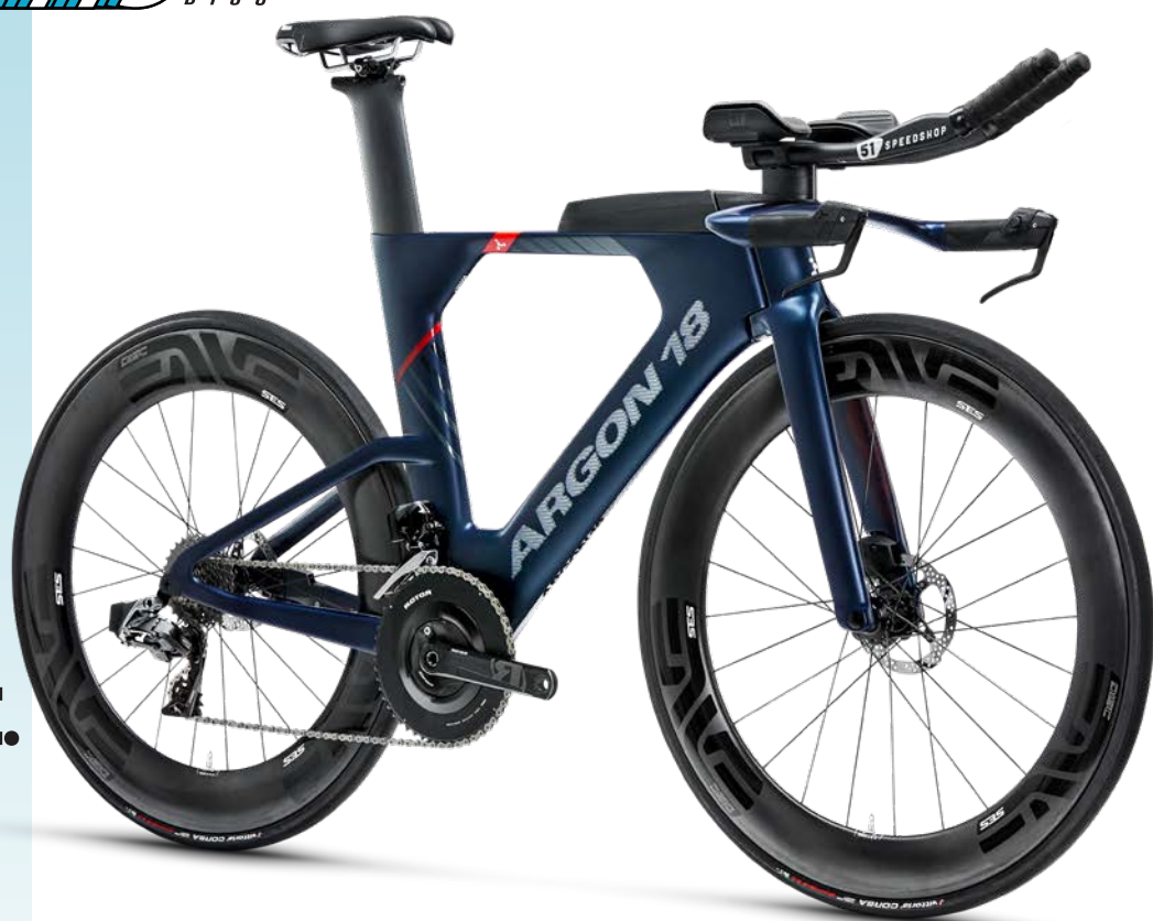
345A - Kailua Full Moon, Matte/Gloss

EVERY SECOND. EVERY WATT. EVERY ADVANTAGE.