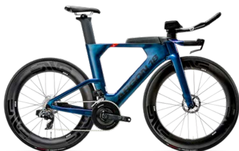
Also available 345B - Dig Me Beach Reflects, Gloss

AERO · We took what we learned through rigorous development of our new Electron Pro track bike and stripped away the UCI limits. Lowering the SS/ST connection, revising the fork and handlebar profiles, removing quick releases, and redesigning the TT/ST junction are among the things that allowed us to optimise aero results.