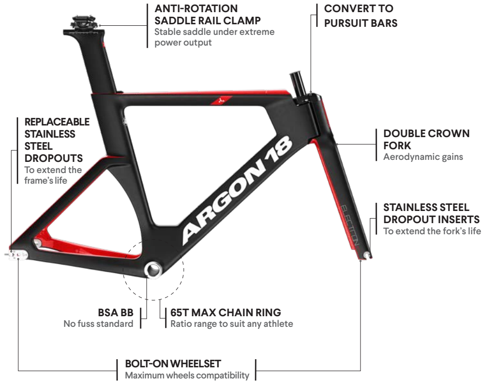
306A - Black Matte, Red Gloss