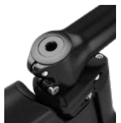
Regular stem (adapter included)

See assembly guide for comprehensive list HERE