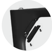
Fiber glass side for live data transmission