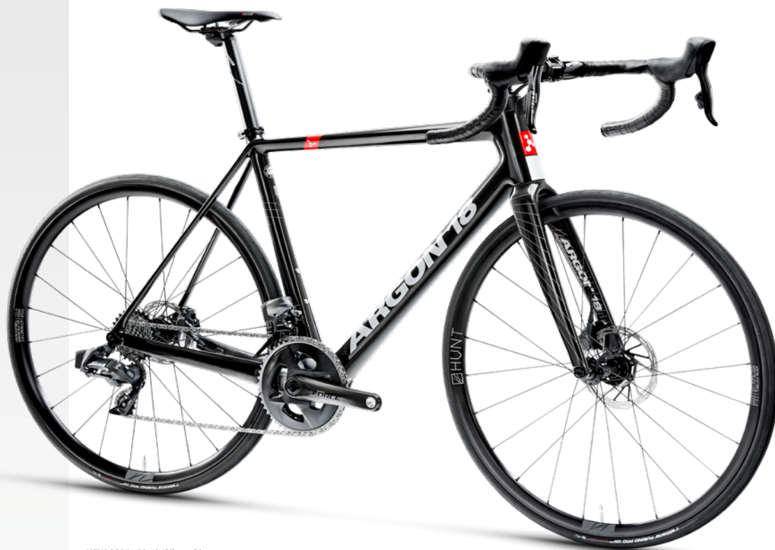
NEW 362A - Black/Silver, Gloss

Building on the technological know-how of the Gallium Pro Disc, and now available with a semi-integrated cockpit, the new Gallium CS Disc is the perfect way to make a mark on those long training days, or to jockey for rank on group rides. This is the bike that will be ready when you are, whether that includes a punishing climb, soaring descent, or flat-out sprint to the coffee shop. Easy to fit, intuitive to maintain and a pure pleasure to ride, the new Gallium CS Disc equally suits the randonneur and racer.