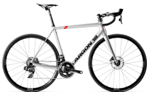
Also available NEW 362B - Silver/Black, Gloss

ALL THE RIGHT FEATURES – AT THE RIGHT PRICE • The new Gallium CS Disc features our 3D press-fit system and comes with a semi-integrated cockpit. It is also fitted with a replaceable rear derailleur hanger, a riveted aluminum front derailleur hanger and a chainsuck protector, all at one of the most competitive pricepoints for disc-equipped carbon performance road bikes.