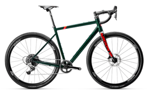
356A - Tundra Green, Gloss

LOADED WITH FEATURES · Internal cable routing at the headset external at chainstays, a 27.2 \text{mm} \ \emptyset seatpost and our 3D headset with cable integration for easily dialled-in fit options.