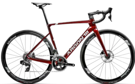
Also available 353B - Race Day Reg, Gloss

ALL THE BEST FEATURES · Loaded with real-world, rider-oriented details like non-proprietary cockpit, our updated 3D system for the widest fit window, easy adjustment - and maximum stiffness, and generous tire clearance (30c).