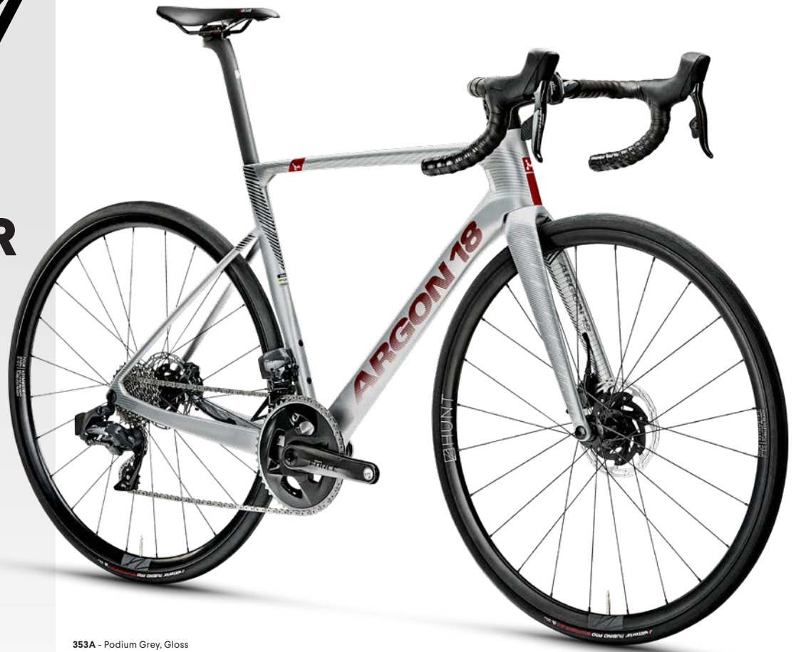
353A - Podium Grey, Gloss

Own the season: the SUM will get you ahead on the climbs, keep you there on the flats, and power you through the sprints. Featuring the same optimal balance of aero and weight as the SUM Pro, the SUM is your all-around KOM-hunter.