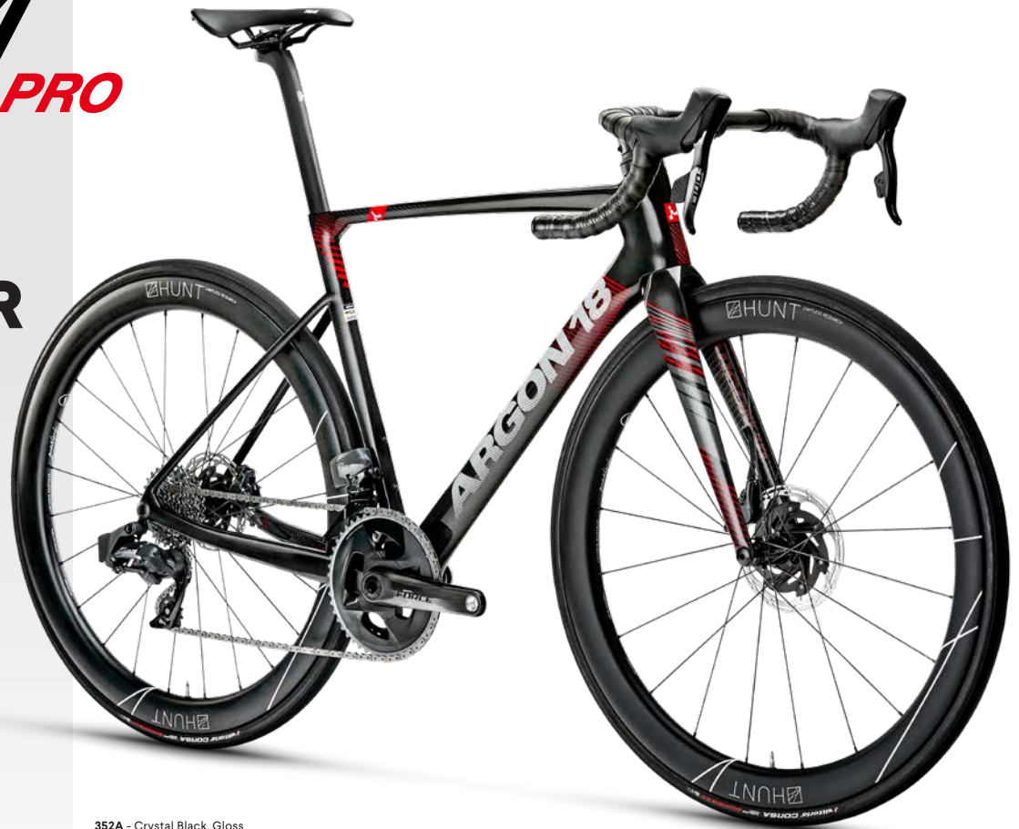
352A - Crystal Black, Gloss

Meet the best of the best: aero to match the Nitrogen, pure road performance to match the Gallium Pro, with race-ready handling and premium ride quality. The all-new SUM Pro features our most advanced layup and technologies to get you to the front of the group and keep you there, through the climbs, the corners, and the sprints.