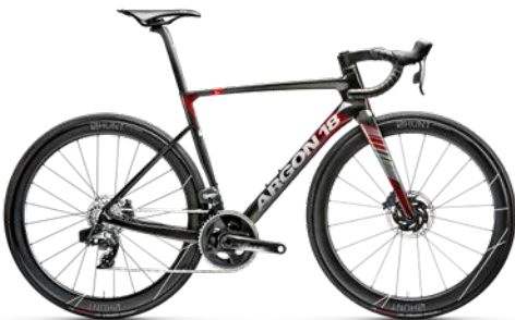
352A - Crystal Black, Gloss

PACKED WITH FEATURES · Loaded with real-world, rider-oriented details like non-proprietary cockpit, our updated 3D system for the widest fit window, easy adjustment - and maximum stiffness, and generous tire clearance (30c).