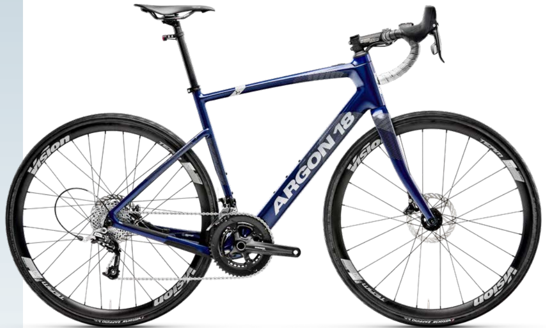
NEW 360A-Deep Blue, Gloss

When you want to push yourself through that extra 50km or take the steepest route to the top – and actually enjoy the views on the way up – or want to finally let go of the myth of the suffer-fest, the Subito eRoad is your ride. And with a sub-12kg bike that handles, fits, and responds at the top of its class, it may provide all that even without the assistance of the motor. But if you want that bit of extra tailwind, it's ready for you.