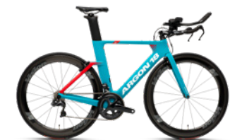
TEAL BLUE MATTE