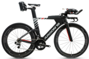
BLACK MATTE/ GREY GLOSS

ALWAYS THE TRENDSETTER The E-119 Tri+ gets a new paint job for 2019 but rest assured, under these eye-catching cosmetics you will find the same amazing bike that has redefined the category when it first came out a couple of years ago. It was so far ahead of the game then that it is still the one others look up to today.