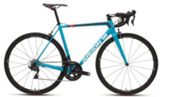
TEAL BLUE MATTE