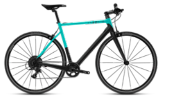
BLACK / ELECTRIC MINT GLOSS

YOU CAN HAVE IT BOTH WAYS GO! can be built as a straight bar urban bike for fast commuting or, you can have it built to the hilt with drop bars making it the perfect affordable carbon road bike.