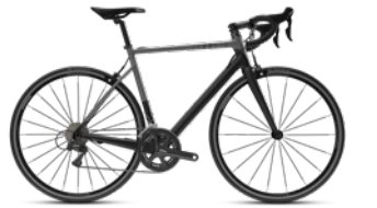
BLACK / ANTHRACITE MATTE