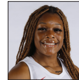
#30 • Hill