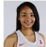
#5 • Gladney