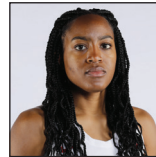
#23 • Blackshell-Fair