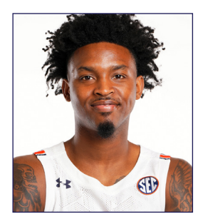
G · 6-1 · 190 · Gr. Augusta, Ga.