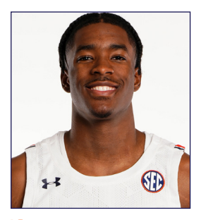
G • 6 - 6 • 190 • Fr. Harrisburg, Pa.