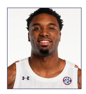
F · 6-6 · 230 · Jr. West Memphis, Ark.