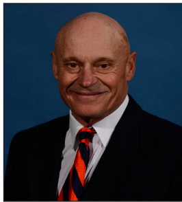
J.B. Grimes Offensive Line