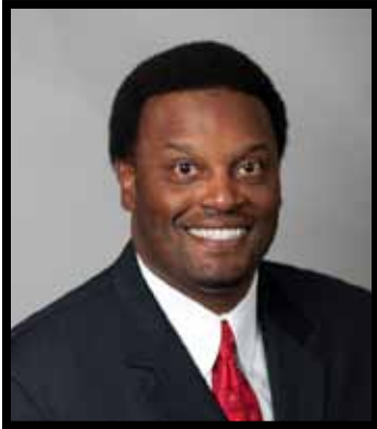
KEVIN SUMLIN HEAD COACH