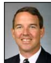
ALAN CANNON SID/ Creds/Interviews