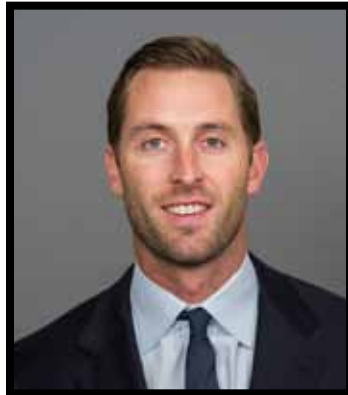
KLIFF KINGSBURY OFFENSIVE COORDINATOR QUARTERBACKS