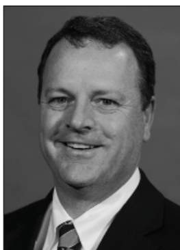
TIM HORTON RUNNING BACKS