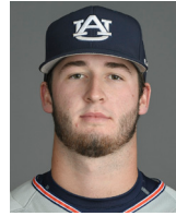
11 CHASE HALL