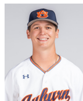
21 TRACE BRIGHT