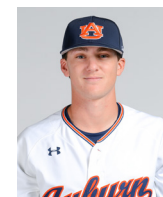
37 MASON LAND