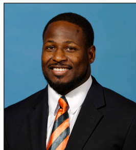
Carnell Williams Running Backs