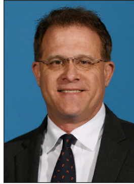
Gus Malzahn Head Coach