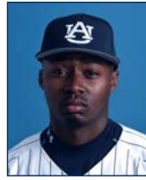
4 DAINO DEAS