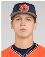
21 TRACE BRIGHT