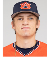
6 MATT SCHEFFLER