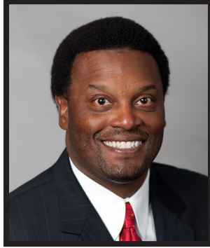
KEVIN SUMLIN HEAD COACH