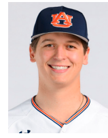
21 TRACE BRIGHT