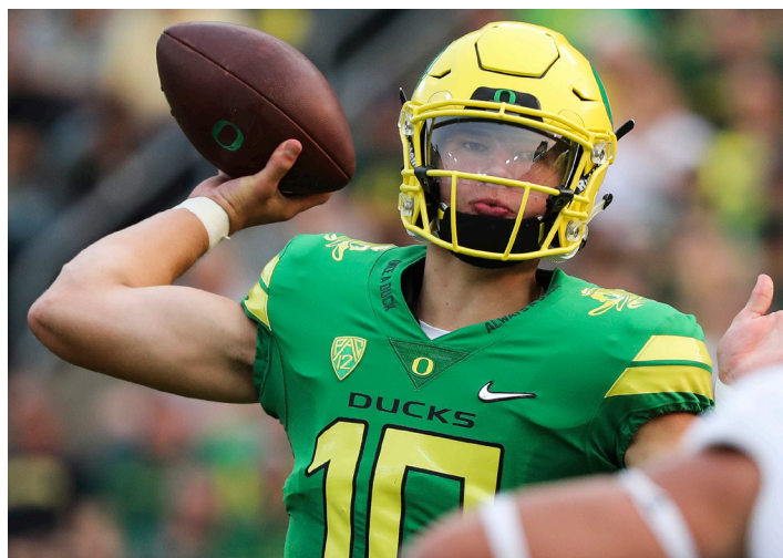
In his first career start in a season opener, JUSTIN HERBERT helped Oregon set program season opener records for points (77), touchdowns (11), rushing TDs (9) and first downs (37) vs. Southern Utah in 2018.

# - Game played in Arlington, Texas % - Game played in Portland, Ore.