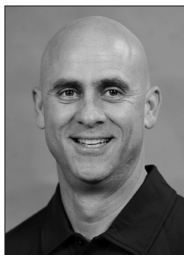
WILLIE MARTINEZ SECONDARY