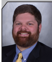
Will Windham Safeties