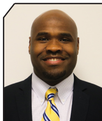
Justin Hood Secondary