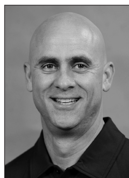
WILLIE MARTINEZ SECONDARY