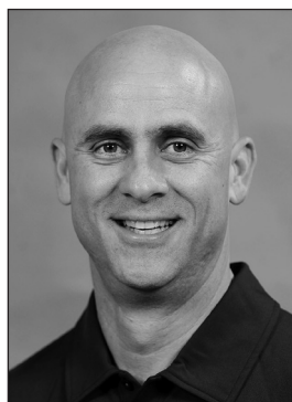
WILLIE MARTINEZ SECONDARY