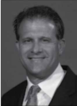
GUS MALZAHN HEAD COACH