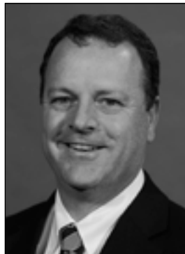
TIM HORTON RUNNING BACKS