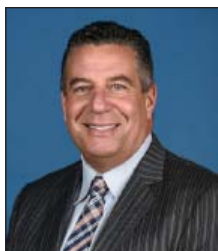
Bruce Pearl Head Coach