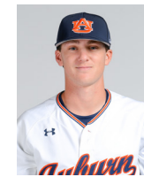
37 MASON LAND