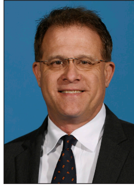
Gus Malzahn Head Coach