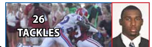
TACKLES: KENTRELL BRICE