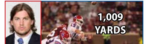
PASSING: CODY SOKOL